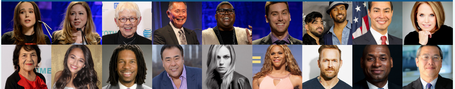
Previous conference speakers and special guests