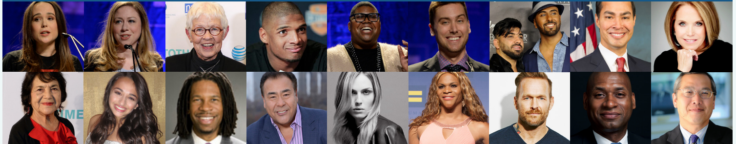
Previous conference speakers and special guests