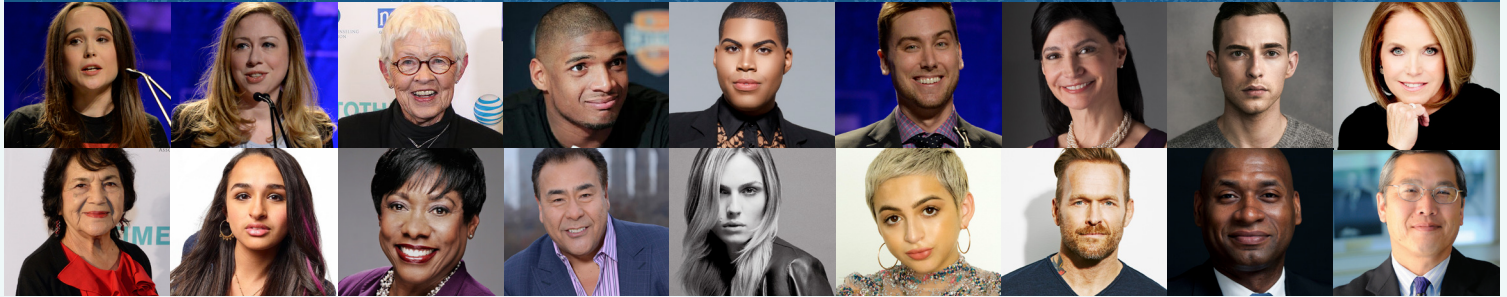
Previous conference speakers and special guests