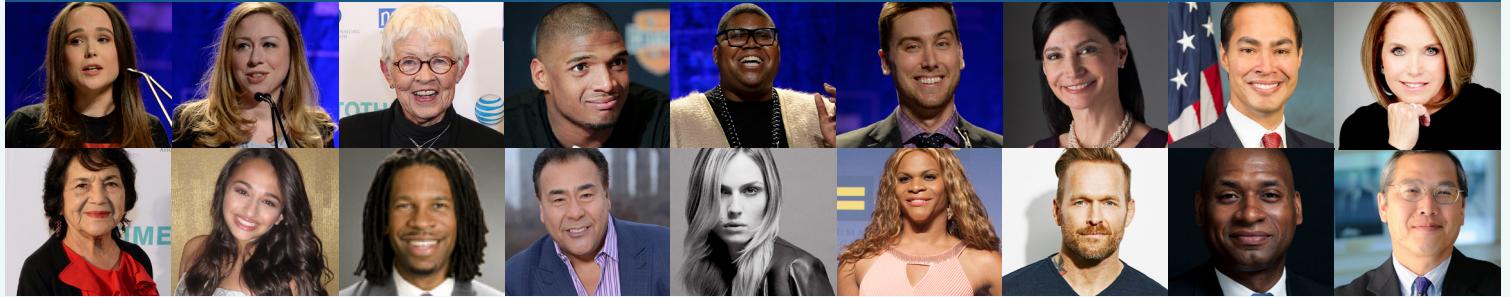
Previous conference speakers and special guests