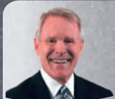
Ray Mabus, Former Secretary of the Navy

“I am not aware of any evidence to support President Trump's stated rationales for reversing the policy permitting open service... The Working Group did not find that permitting transgender soldiers to serve would impose any significant costs or have a negative impact on military effectiveness or readiness. ”