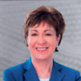
Sen. Susan Collins, R-ME

“If individuals are willing to put on the uniform of our country, be deployed in war zones, and risk their lives for our freedoms, then we should be expressing our gratitude to them, not trying to kick them out of the military. ”