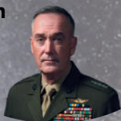
General Joseph Dunford, Chairman of the Joint Chiefs of Staff

As reported by Buzzfeed News , Dunford was “surprised” by Trump's tweets. Said Dunford: “ When asked, I will state that I was not consulted. ”