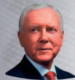
Sen. Orrin Hatch, R-UT

“If individuals are willing to put on the uniform of our country, be deployed in war zones, and risk their lives for our freedoms, then we should be expressing our gratitude to them, not trying to kick them out of the military. ”