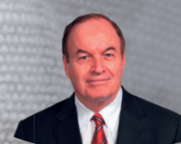
Sen. Richard Shelby, R-AL

“I don't think we should be discriminating against anyone. Transgender people are people, and deserve the best we can do for them. ”