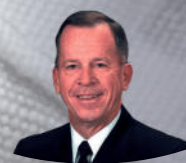
Admiral Mike Mullen, Former Chairman of the Joint Chiefs of Staff

“When less than one percent of Americans are volunteering to join the military, we should welcome all those who are willing and able to serve our country. ”