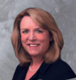
Deborah Lee James, Former Secretary of the Air Force

As reported by Buzzfeed News , Dunford was “surprised” by Trump's tweets. Said Dunford: “ When asked, I will state that I was not consulted. ”