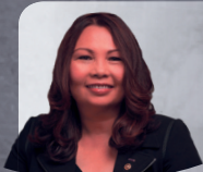
Sen. Tammy Duckworth, D-IL

“You ought to treat everybody fairly and give everybody a chance to serve. ”