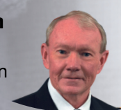
General Martin Dempsey, Former Chairman of the Joint Chiefs of Staff

“I cannot recall another instance in United States military history of such a stark and unfounded reversal of policy, or of any example in our nation's history in which a minority group once permitted to serve has been excluded from the military after its members had been allowed to serve openly and honestly. ”