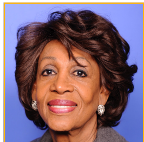
The Honorable Maxine Waters, US House of Representatives She/Her

Congresswoman Maxine Waters is considered by many to be one of the most powerful women in American politics today. She has gained a reputation as a fearless and outspoken advocate for women, children, people of color and the poor.