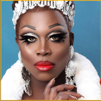
BOB THE DRAG QUEEN