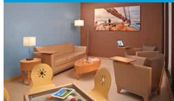
Newly renovated family lounge at Jackson Memorial