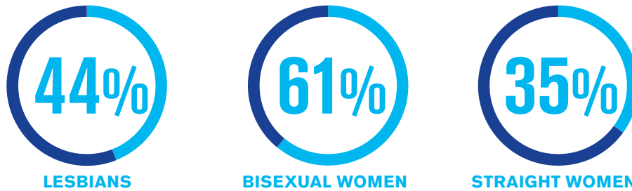
CDC's National Intimate Partner and Sexual Violence Survey

by an intimate partner at higher rates than their straight counterparts. The 2015 U.S. Transgender Survey found that more than half (54%) of transgender and non-binary respondents experienced intimate partner violence in their lifetimes. 9